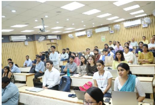
Snippets from the Conference