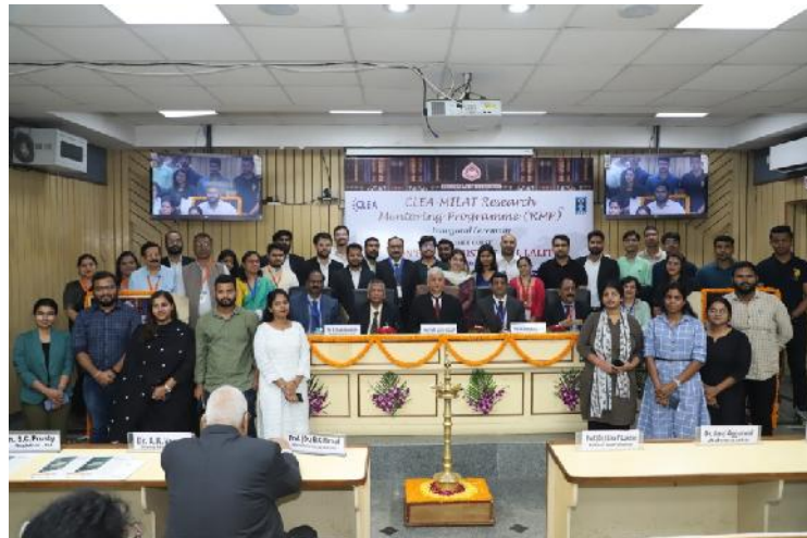
Snippets from the Programme

Each day of the 5-day workshop was divided into 4 sessions Each pertaining to a different topics of study involving legal research, research methods and methodology and research writing.