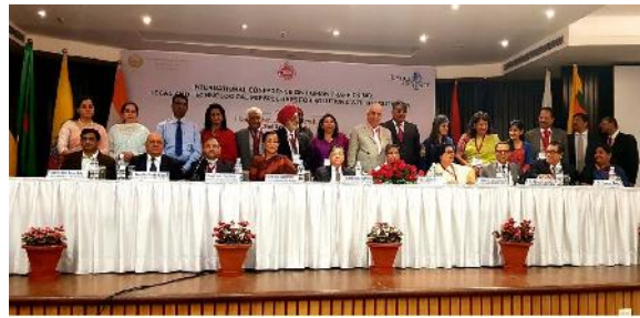
Dignitaries at the International Conference

The objectives of the Conference included “Strengthening the understanding of the issue of human trafficking and how the amalgamation of law and technology plays a vital role for effective intervention strategies; Information sharing from representatives of the SAARC nations and other countries on how law and technology around trafficking are currently positioned within their local jurisdictions; Identifying gaps that exist in the current legislative frameworks as well as technological know-how and offering suggestions for change; Devising innovative solutions for effectively combating the issue in both national as well as the international sphere; Building and presenting sound recommendations that would assist in addressing the issue at national as well as the SAARC regional level”.