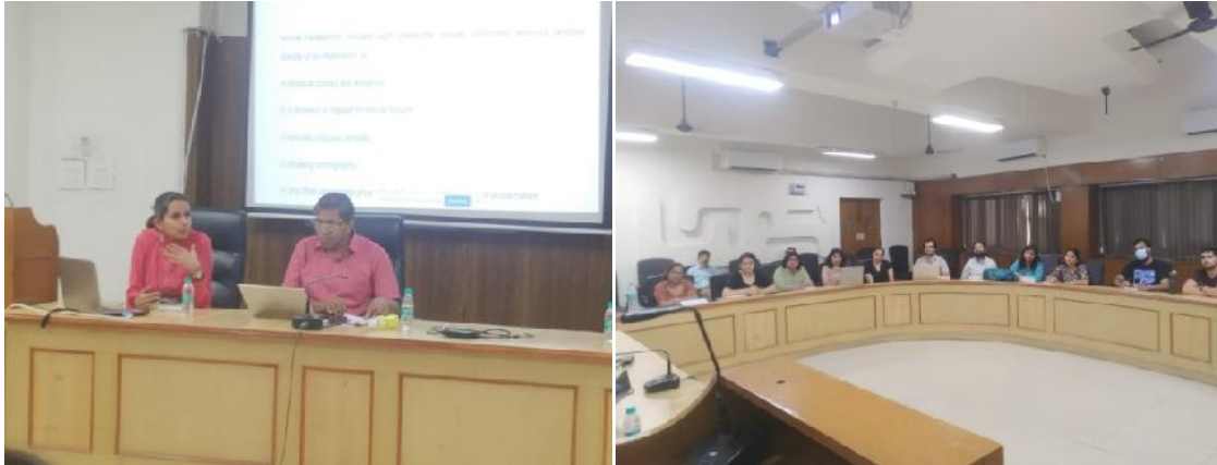
Views from the seminar