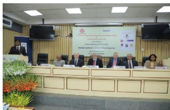
Views from the technical session of the international conference