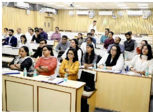
Snippets from the Training Programme