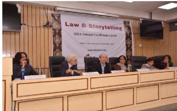
View from the Conference