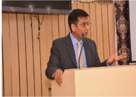
Hon'ble (Dr.) Justice D.Y Chandrachud delivering the keynote address

wonderful insights into their own experience of using the medium of storytelling to understand, explain and apply the law to cases at hand.