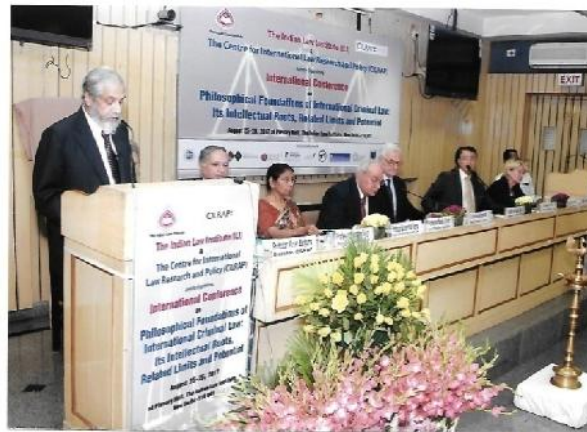
Justice Madan B. Lokur addressing the participants at the conference.

The Indian Law Institute organised an International Conference on Philosophical Foundation of International Criminal Law: Its Intellectual Roots, Related Limits and Potential jointly with various national and international universities on August 25-26, 2017.