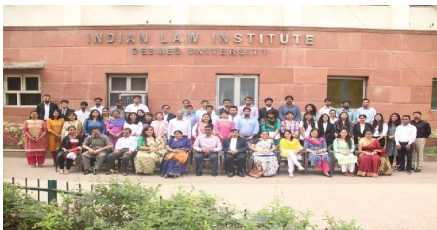
Group photograph of participants of the programme with Chief Guest, Registrar and faculty members of ILL.

The Conference consisted of two technical sessions each spread over a period of two days