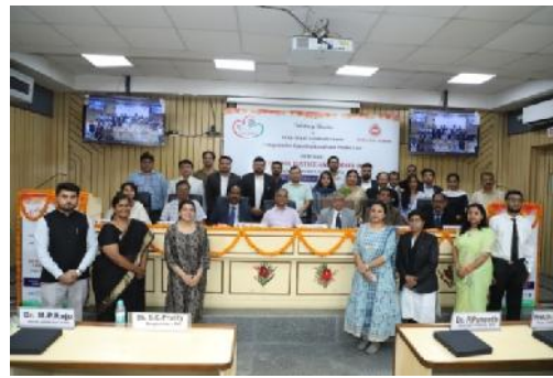
Snippets from the Course