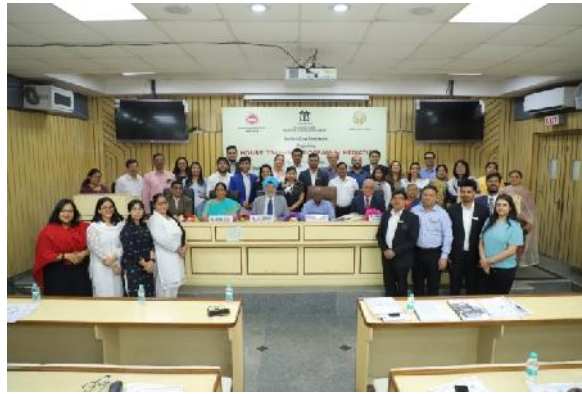
Participants of the training programme along with dignitaries