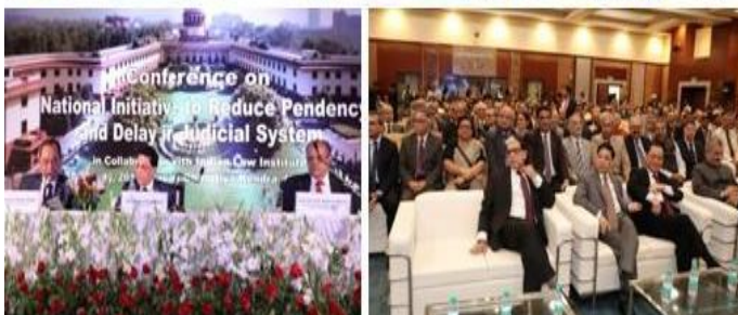
Conference at a glance