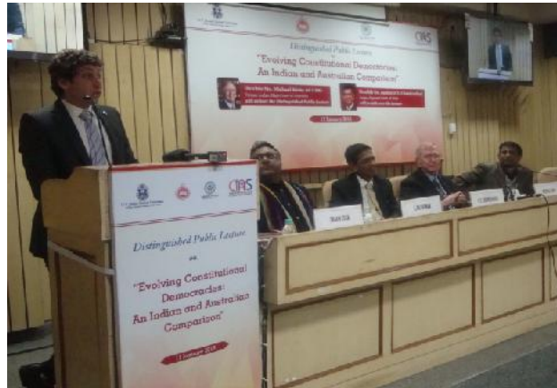
Hon'ble Dr. Justice D.Y.Chandrachud with the dignitaries on the dias