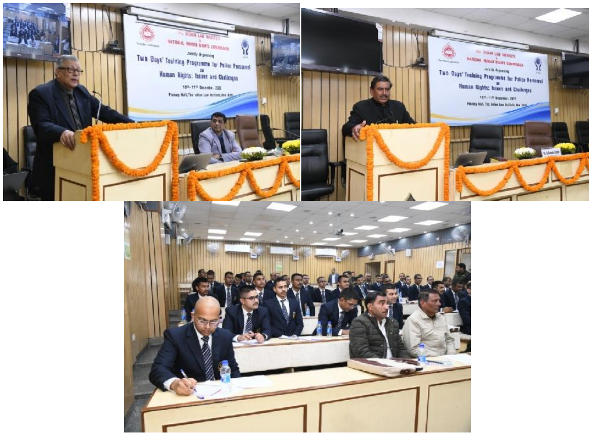
Snippets from the Training Programme

The Indian Law Institute in collaboration with National Human Rights Commission organized a two-day program for Police personnel on Human Rights: Issues and Challenges. The training program aimed at sensitizing police officials to the nuances of the human rights framework and the due process guarantees. The Training Programme was inaugurated by Hon'ble Dr. Justice Mukundakam Sharma, Former Judge, Supreme Court of India. Over these 2 days, the participants critically engaged with the relationship of the policing system with myriad concerns like investigative procedures, national security, media impact, and the protection of women and children. The sessions primarily focussed on the way constitutional and human rights order should shape policing practices.