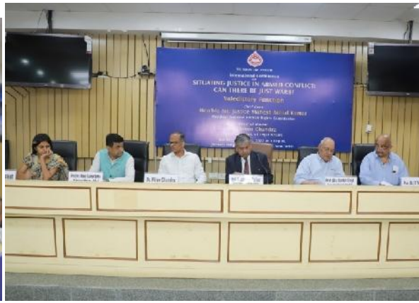
Snippets from the Conference