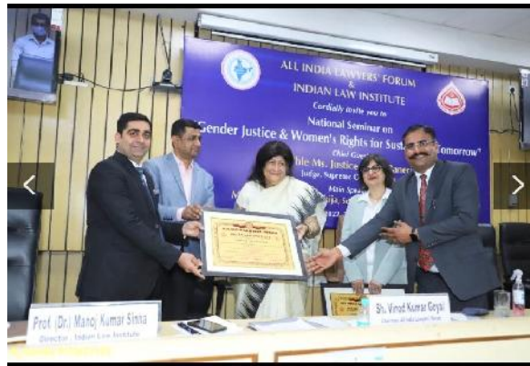
Snippets from the Programme