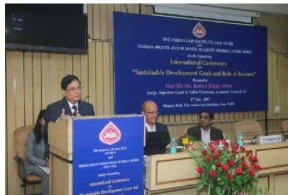
Hon'ble Mr. Justice Dipak Mishra addressing the participant at the programme

The 17 Sustainable Development Goals of the 2030 Agenda for sustainable development were adopted by the world leaders at an historic UN Summit in January 2016. While the Sustainable Development Goals are not legally binding, governments are expected to take ownership and establish national frameworks for the achievement of these goals. Against this backdrop, the Indian Law Institute in collaboration with the Human Rights and Business Academy (HURBA) organised an International Conference on “Sustainable Development Goals and Role of Business” at the Institute on July 8, 2017 to review critically the role of business enterprises in achieving these sustainable development goals.