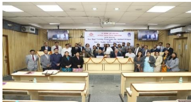
Snippets from the Training Programme