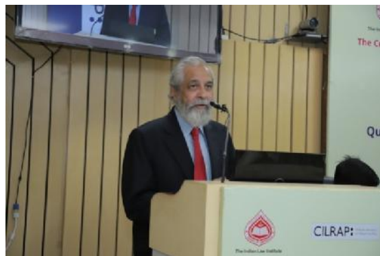
Hon’ble Mr. Justice Madan B.Lokur addressing the audience

This third leg of CILRAP’s broadly-based ‘Quality Control Project’ concerns the phase that encompasses criminal investigation and case-preparation, that is, between the opening of criminal investigation and start of trial. As with the earlier legs of the wider project – called ‘Quality Control in Fact-Finding’ and ‘Quality Control in Preliminary Examination’ – the focus is on core international crimes, but it also includes perspectives from other fact-rich crime such as serious fraud and organised crime (human trafficking).